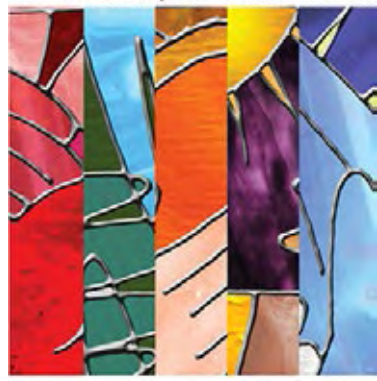
Vision Mission Values

At St. Paul's Hospital, we believe people do their best work when they are working within a system where core values are shared by all.