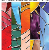
Vision Mission Values