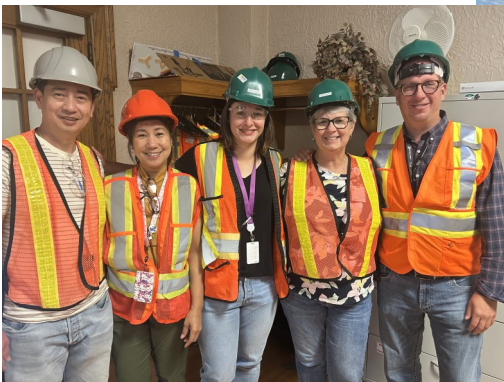
Some of St. Paul's Hospital friendly EVS staff preparing to do their block testing

Before the tape is cut and the public is allowed to access it for the first time, much testing, inspection and reviewing of the space needs to take place by the various departments and teams that will be taking care of or working in the front area and healing center. It is like stepping into the blueprint and being able to consider the planning in a much more concrete manner.