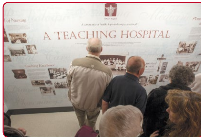
Attendees view the mural describing the teaching history of St. Paul's Hospital in the lobby of Pylypchuk Hall.