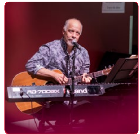
Musician Dan Hill reflecting on his personal journey with prostate cancer at the Gormley Gathering.