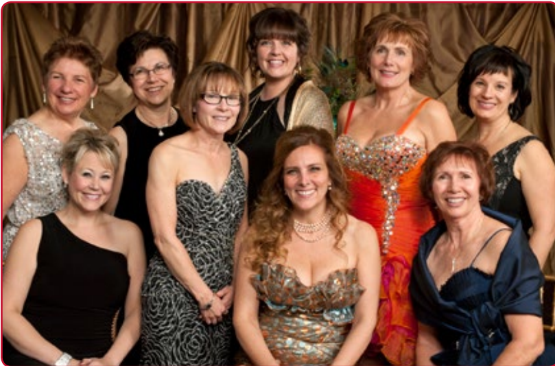
Mistletoe Ball Committee Members