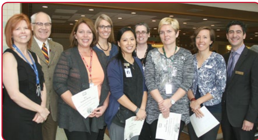
A few of St. Paul's Hospital Foundation 2013 Professional Development Award Recipients with members from the SPH and SPH Foundation Boards of Directors.